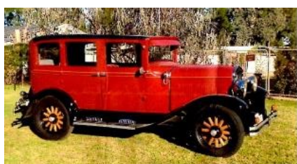
1929 De Soto Fully restored $23,000 Jeff Lee

Contact Tony Warner lancelot2@westnet.com.au , 0417 555 073 or PO Box 1399 Midland DC 6936 . Note, please contact me when your item has been sold.